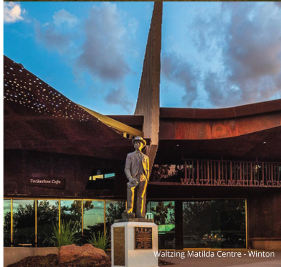
Waltzing Matilda Centre - Winton

LAST SEATS! DEPARTS BRISBANE 18 SEP 2021