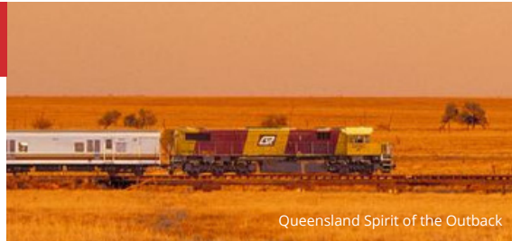
Queensland Spirit of the Outback