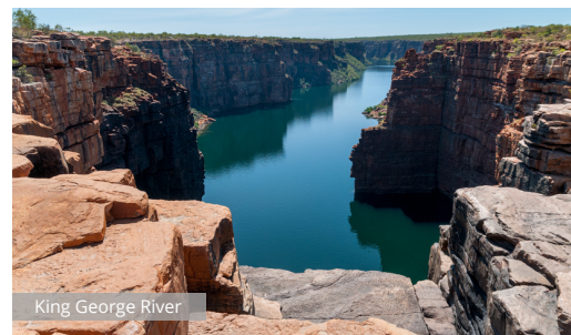
King George River