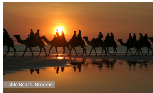
Cable Beach, Broome